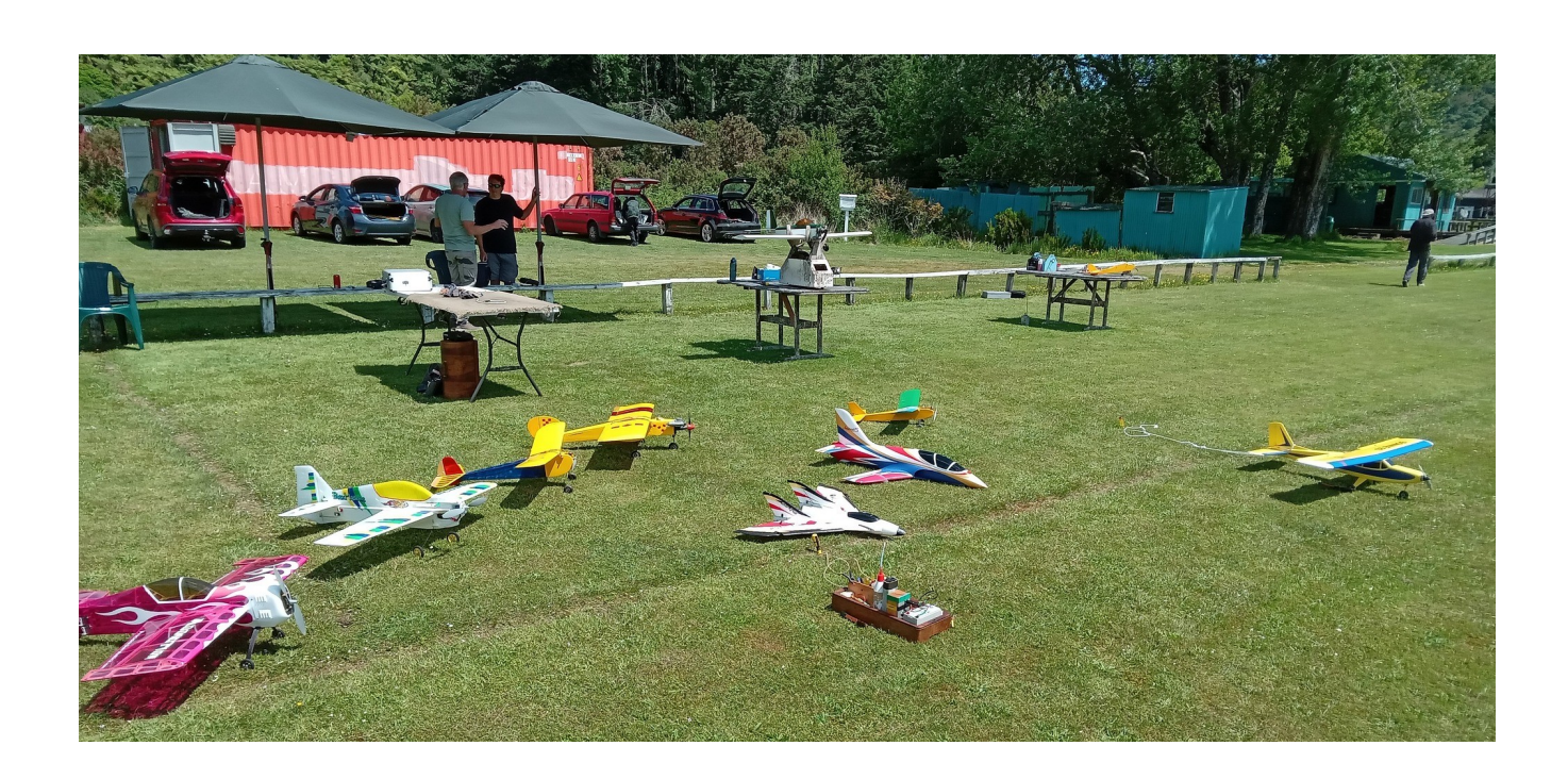
Models seen at a recent midweek session

Meanwhile in some countries model registration and pilot registration has become mandatory. Requirements for models to carry ADBS identification are being looked at. Lets hope the new government inject a dose of reality into the situation here.